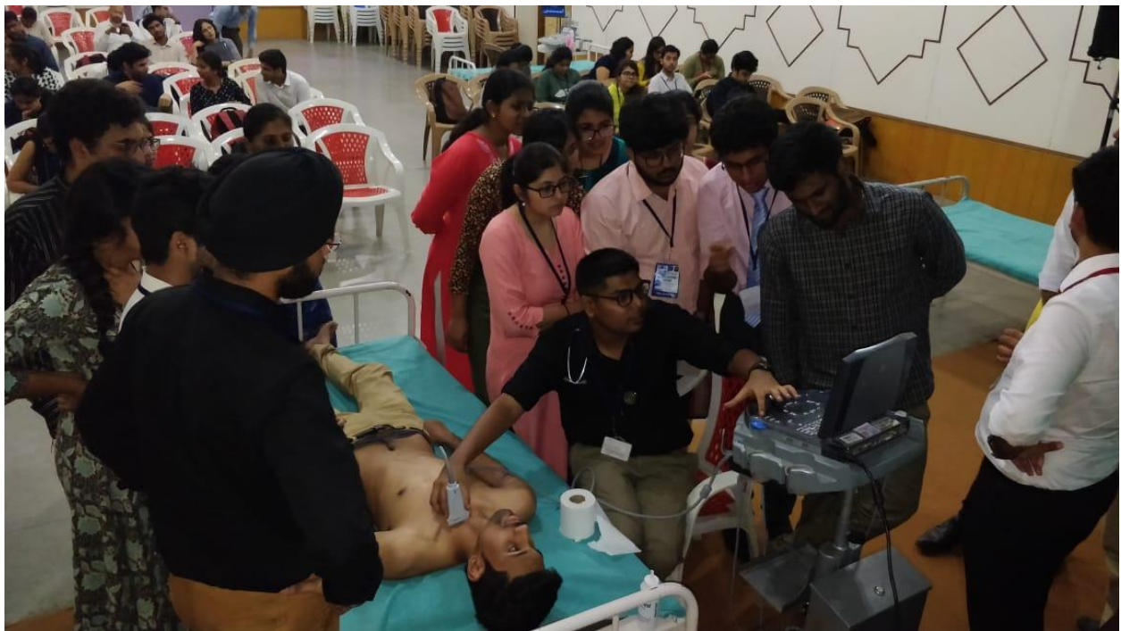
Workshop on Emergency Ultrasound