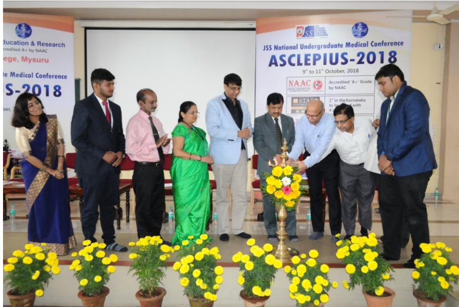
Inauguration of conference by lighting the lamp