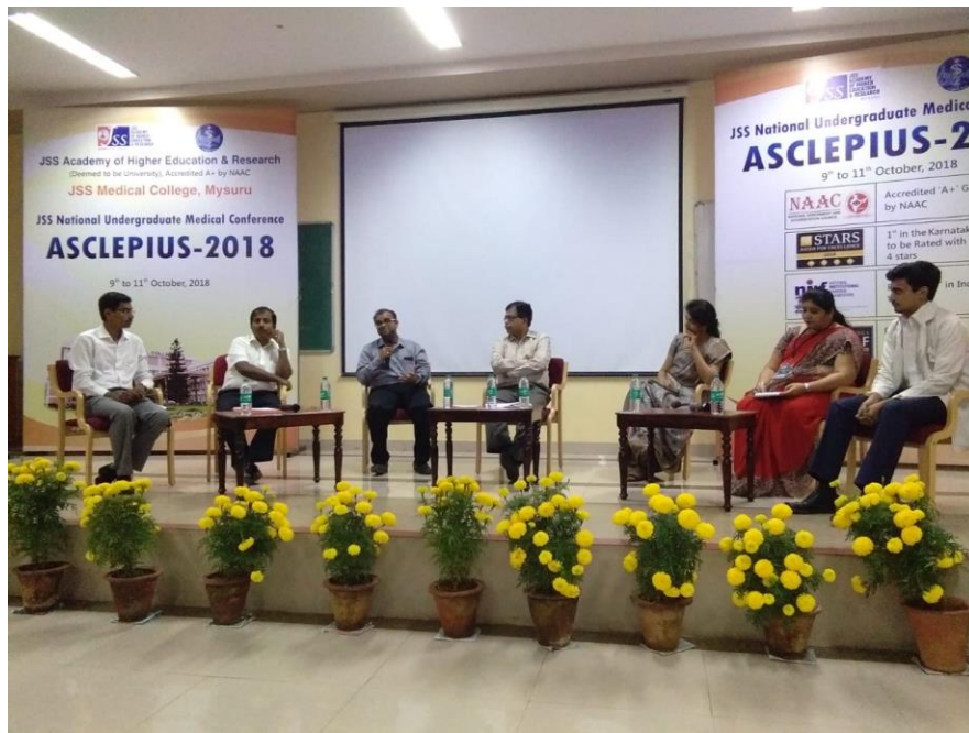
Panel discussion on Implementation of New MBBS curriculum